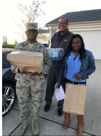
Hunt Military Communities Resident Services Specialists & Air Force Team Up to Deliver Meals to Coast Guard Families.